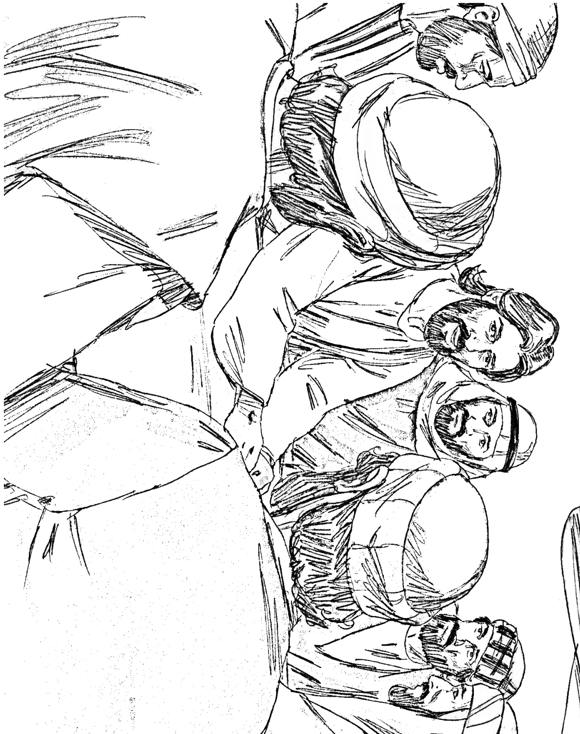
Appearing to the Disciples Luke 24:36-48

220 40th St NE Cedar Rapids, Iowa 52402 www.christepiscopal.org